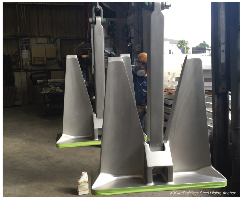
430kg Stainless Steel Hiding Anchor