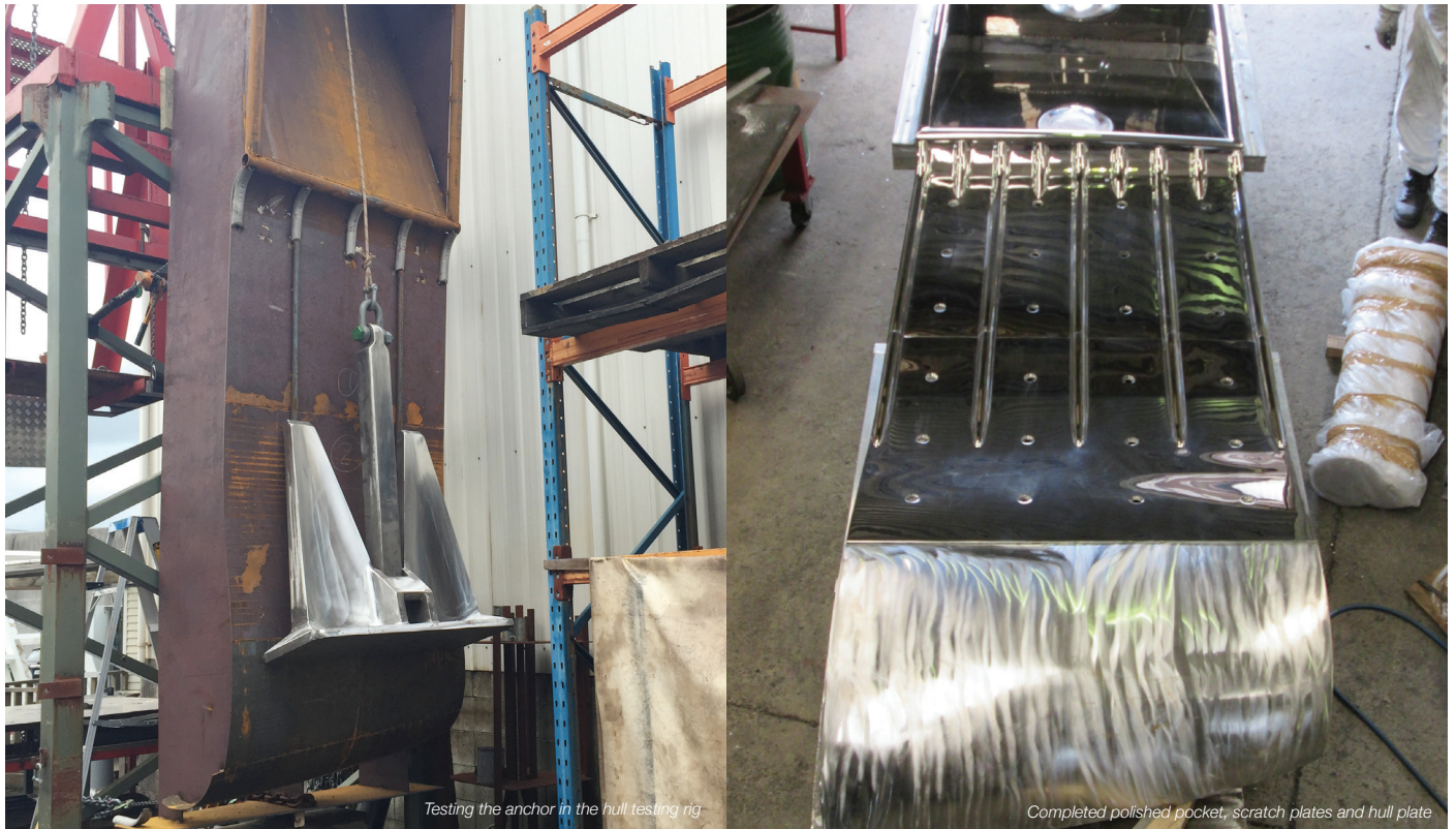
Testing the anchor in the hull testing rig

BOWMASTER MOORING : ANCHORING : DEPLOYMENT : ACCESSORIES