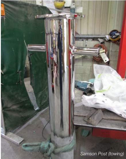
Samson Post (towing)

BOWMASTER MOORING : ANCHORING : DEPLOYMENT : ACCESSORIES