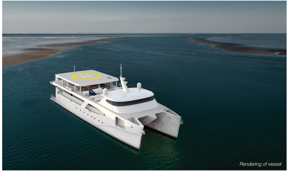
Rendering of vessel