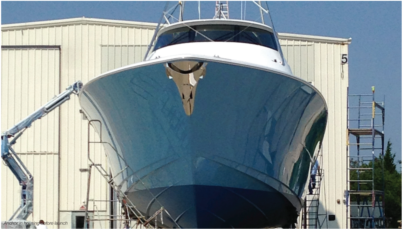
Anchor in housing before launch